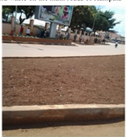
Figure 3 indicates the trend of solid waste on the main roads of Kampala

Sharing solid waste has resulted into instant improvement of sanitation conditions in the city. At least on all the main roads and the water channels, there is commitment to ensure Kampala imitates a beautiful and clean city like those in developing countries such as Malaysia. The modest improvement in solid waste efficiency can be viewed instantly within the city as shown in the pictures below in figure 3.