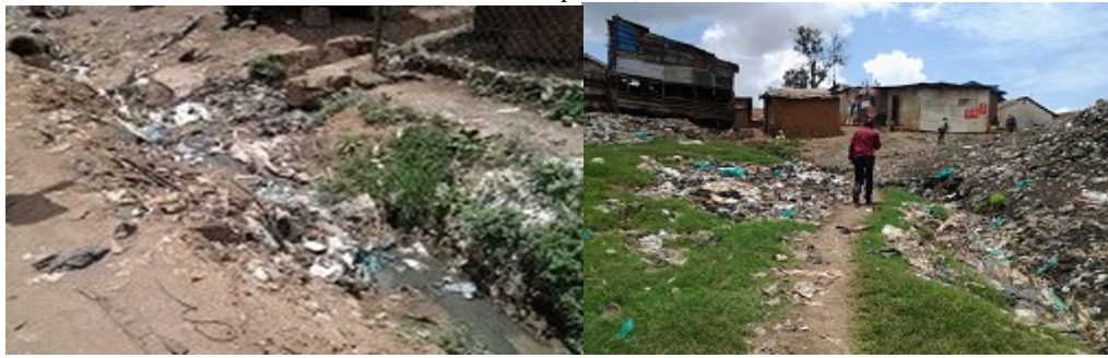
Figure 4 and 5: indicates the trend of solid waste in Kampala suburbs