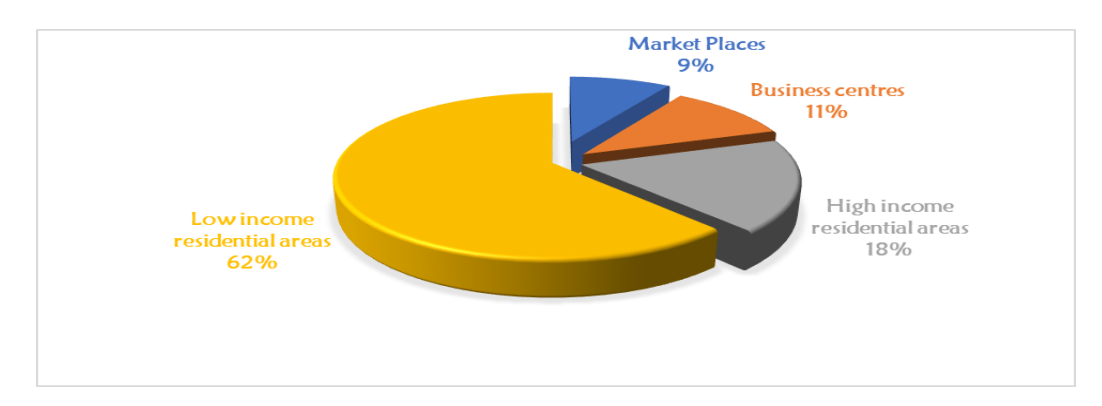
Figure 2. Sources of Waste Reaching Dumping Site in Kiteezi